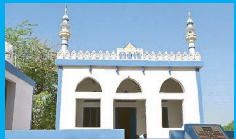
Top: Masjid-e-Masaud in in Village Nizam Ul Din Nohri, Tharparkar, Sindh, Pakistan