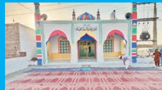
Masjid Rubina Mehtab Village Basti Jannat, Tehsil Khan Pur Rahim Yar Khan, Punjab, Pakistan