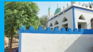
Masjid Noor e Islam Village Muhammad Punhal Lohar Shikarpur, Sindh, Pakistan