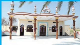
Masjid Muhammad Jamil Village Bharat, Bannu Khyber Pakhtunkhwa, Pakistan